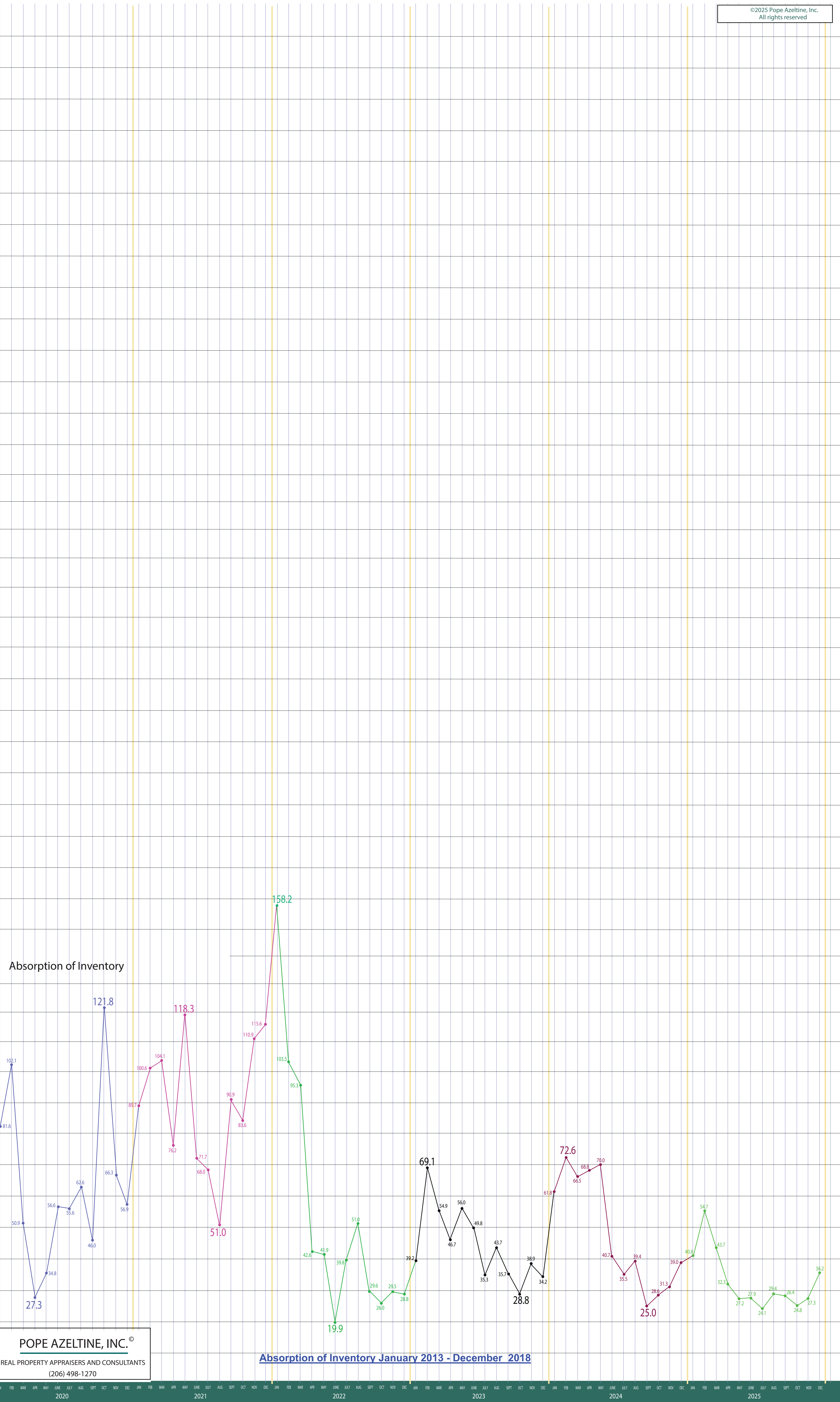
Absorption of Inventory January 2013 - December 2018

POPE AZELTINE, INC.® REAL PROPERTY APPRAISERS AND CONSULTANTS (206) 498-1270