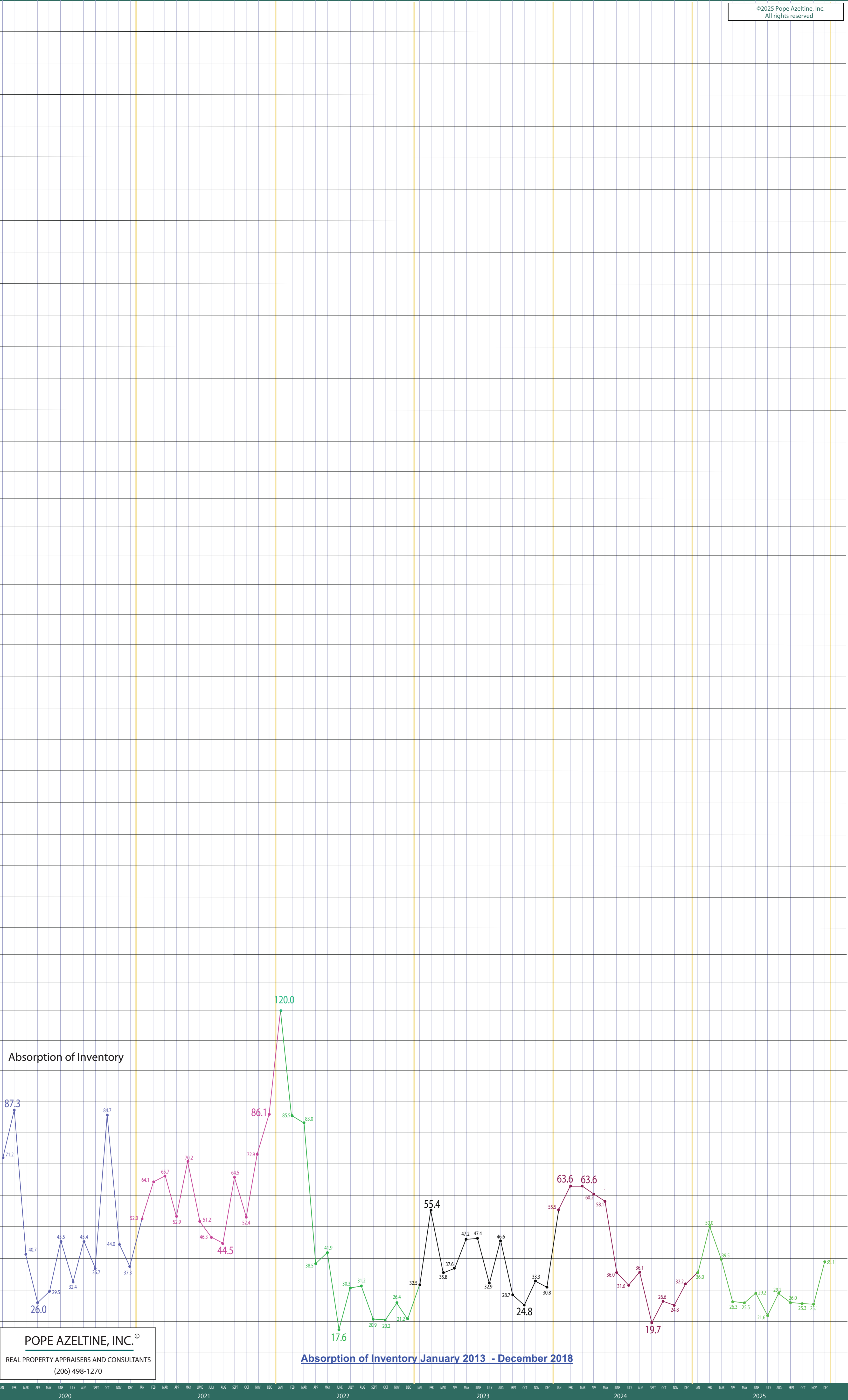
Absorption of Inventory January 2013 - December 2018

POPE AZELTINE, INC.® REAL PROPERTY APPRAISERS AND CONSULTANTS (206) 498-1270